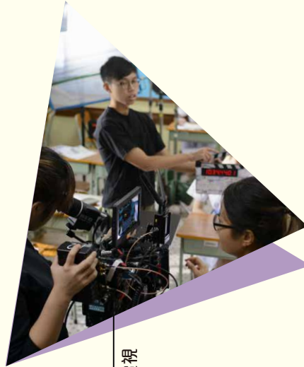
Film and Television 電影電視