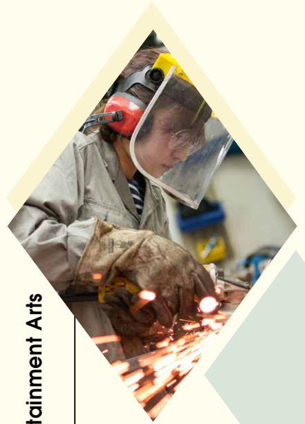
Theatre and Entertainment Arts 舞台及製作藝術